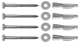
Heavy-duty mounting kit included (Screws and Wall Plugs).