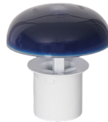
Magma 2.0 High-Performance Odor Trap